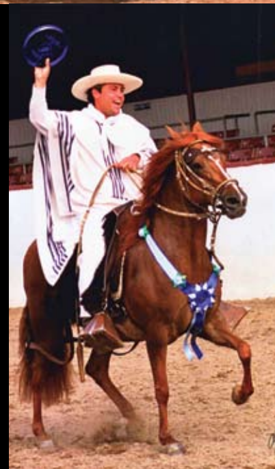
Below: RDLF Penumbra, by *Carbon de la Palizada out of Bugambilia, the next generation of one of the Florecita nicks.