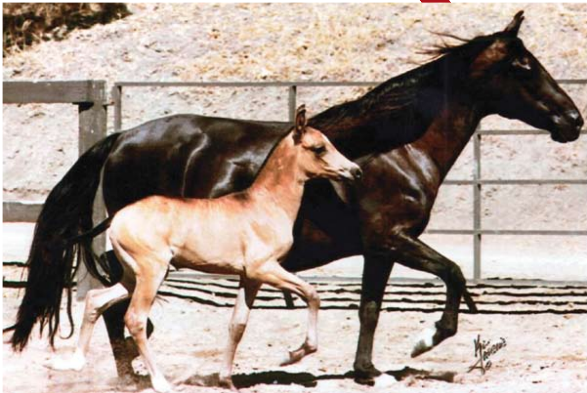
Mascara with her foal by *HNS Domingo+, RDLF Crecencia. This filly went on to be the dam of champion RDLF Sol Peruano.

IN THE HORSE WORLD a Nick might be defined as the ability of certain crosses to consistently produce high quality offspring. For example, a stallion might sire outstanding foals primarily when mated to the daughters of a certain unrelated stallion.