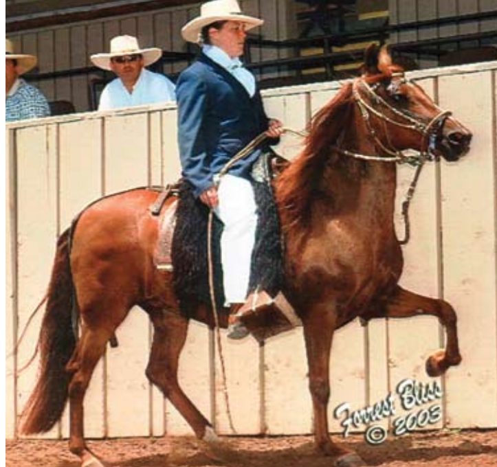
Top: RDLF Seniorita+, a product of the *HNS Domingo+ and Aureola de la Florecita nick that has been so successful for Rancho de la Florecita.

Another nick that worked extremely well was *HNS Domingo+ with *Mantequilla daughters. RDS Me Llamu Peru++ was the result of that cross. We crossed *HNS Domingo+ with our *Mantequilla