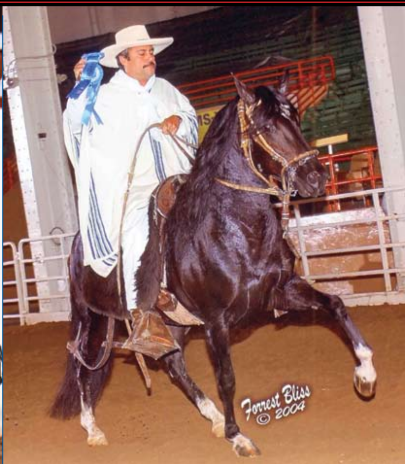
Left: RDLF Celene, from the *HNS Domingo+ /Mascara nick. This was a very successful nick for Florecita. Above: RDLF Lando, the next generation of a Florecita nick, this time, out of RDLF Celene by *Carbon de la Palizada.

daughter Mascara and got RDLF Celene: five time National Champion, RDLF Crecencia: Champion of Champions Breeding Mare and Best Gaited Horse of Show and RDLF Genoveva: Best Gaited Horse of Show. From them we have RDLF Sol Peruano (by *HNS Domingo+), RDLF Lando (by *Carbon de la Palizada), RDLF Candente (by *Carbon de la Palizada), RDLF Mi Ilusion (by *Carbon de la Palizada) and RDLF Mariana (by *Carbon de la Palizada), all first place winners and Champions.